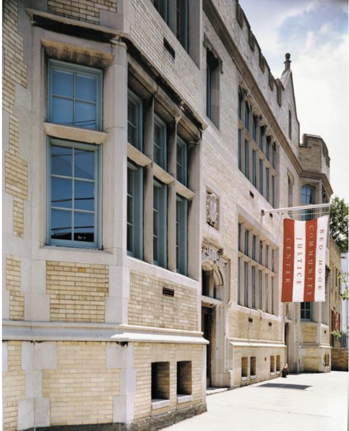
Center for Court Innovation